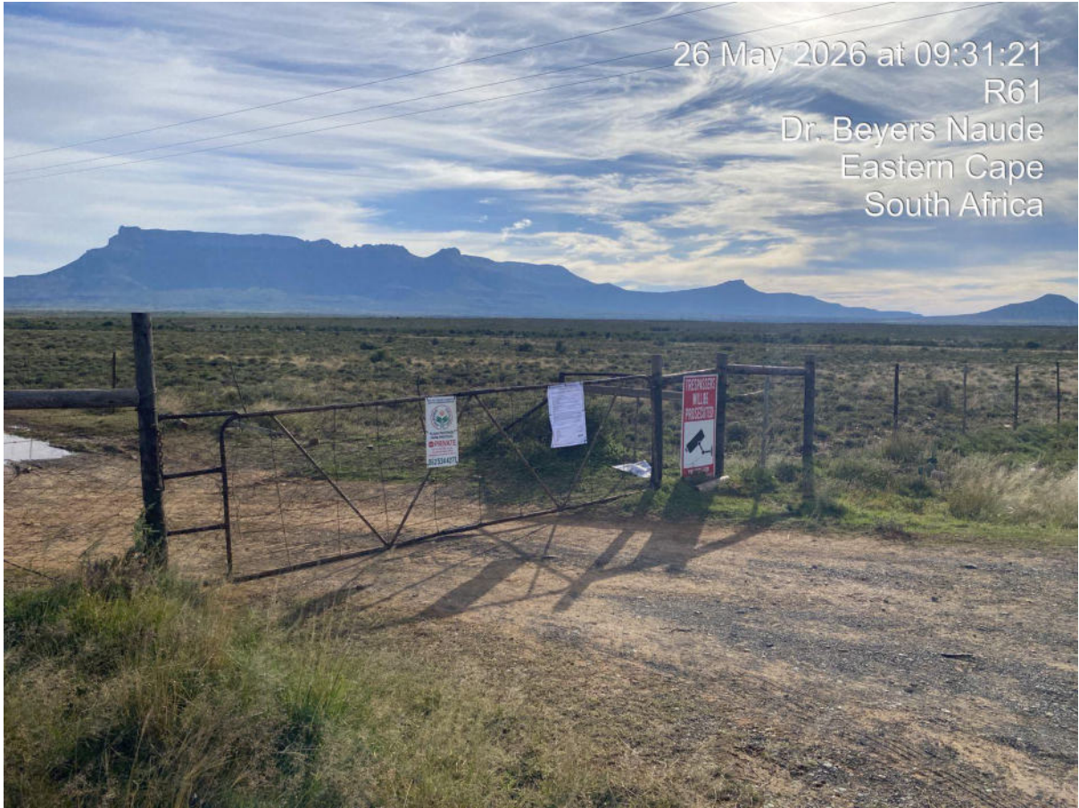
26 May 2026 at 09:31:21 R61 Dr. Beyers Naude Eastern Cape South Africa