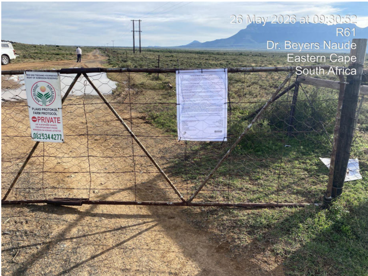
26 May 2026 at 09:30:52 R61 Dr. Beyers Naude Eastern Cape South Africa